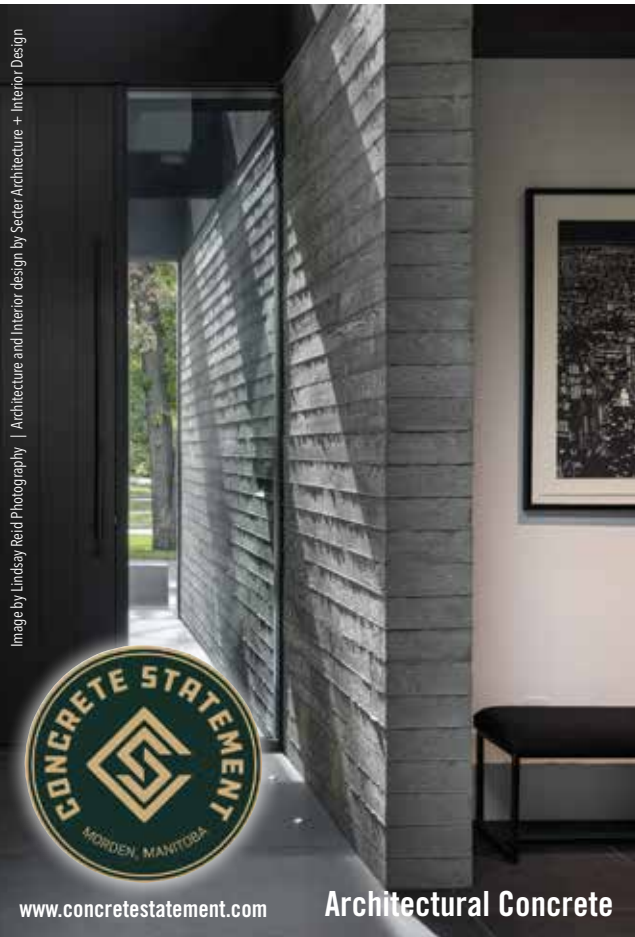
Architecture and Interior design by Selter Architecture + Interior Design