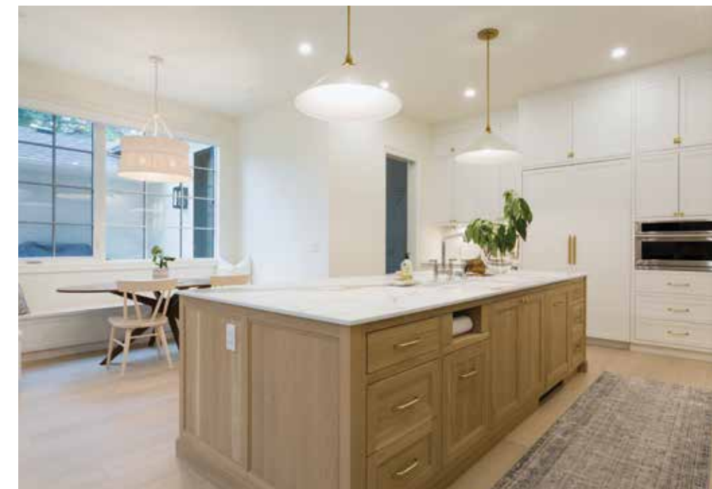
Abundant cabinetry supplied by Kroeker Cabinets offers convenient storage.

Also on the main floor is a large mudroom, with handy bench seating and plenty of space to stash coats and footwear. The blue-grey cabinetry has small holes incorporated to help items "breathe" while in storage.