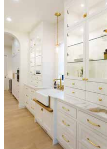
A butler's pantry adjacent to the kitchen is replete with more abundant cabinetry supplied by Kroeker Cabinets, and a convenient farmhouse sink.