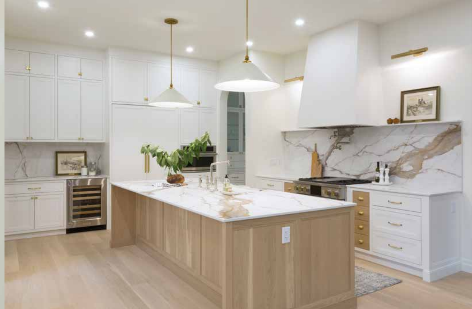
Contemporary light fixtures from Robinson Lighting above the island and the use of mixed metals including stainless steel, gold and brass, provides a sophisticated contrast. The stunning quartz countertops and backsplash from ITAL-Stone were a late-breaking addition.

Robinson Lighting above the island and the use of mixed metals including stainless steel, gold and brass, provides a sophisticated contrast. The stunning quartz countertops were a late-breaking addition, says Henry. "This product came out after the design plans were first made, and we were able to incorporate it at the homeowners' request."