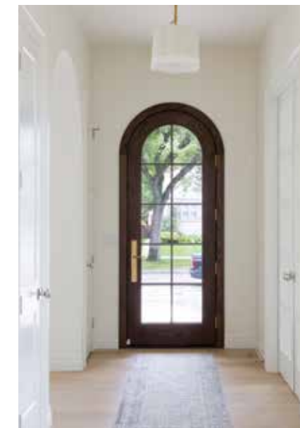
Yarrow Sash & Door supplied this striking black door for the front entrance.

In the kitchen, double shaker style doors on the cabinetry, particularly the taller vertical upper cabinets, help highlight the home's architectural language. Contemporary light fixtures from