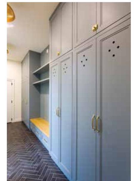
A large mudroom, with handy bench seating provides plenty of space to stash coats and footwear.