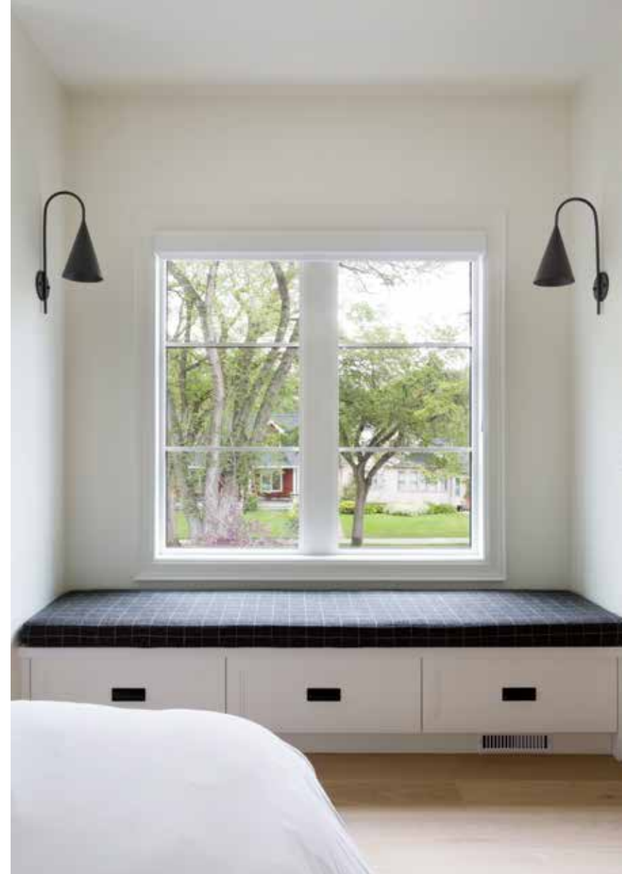
A built-in upholstered bench in the upstairs bedroom is a great space to perch and read.

“We love the house and our vision of English Tudor style is exactly what we hoped for. We wanted to be slightly modern but also still blend in with the community.”