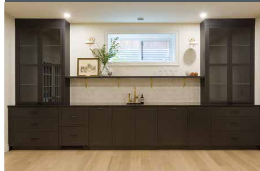
Abundant cabinetry supplied by Kroeker Cabinets offers convenient storage.

Designer Zoe Henry went with a bolder approach for the son’s bathroom, where green tiles line the tub and shower surround, which was glassed in by Fort Rouge Glass. Use of Schluter Profiles adds the finishing touch to tiled walls by concealing exposed tile edges.