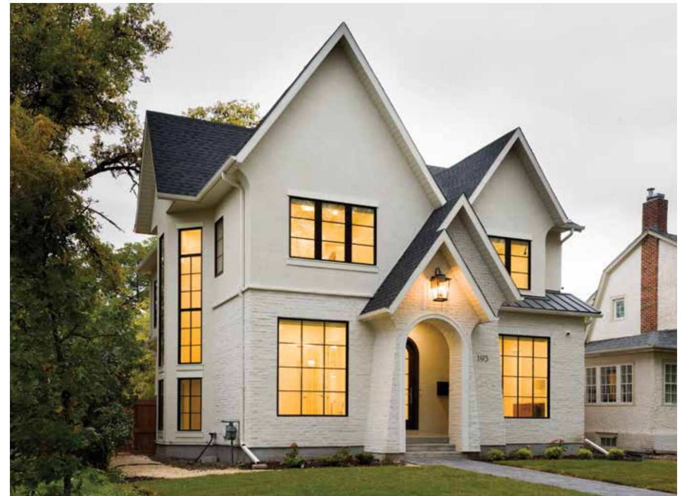
Vertical windows from Duxton Windows & Doors framed in black allow more natural light to filter in and reach the home's main and upper levels.

"As the interior designer, Zoe's creativity and attention to detail was critical to this project," says Laflamme.