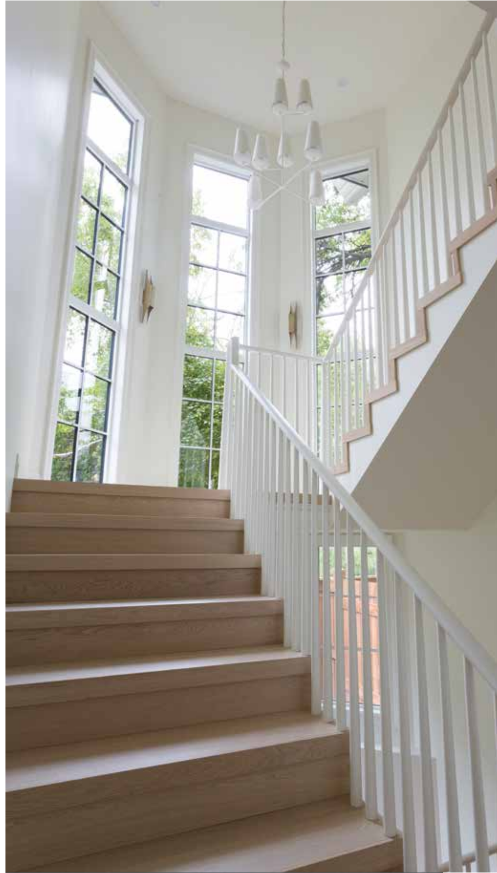
Leading to the upstairs is a wide and sweeping staircase, which receives abundant natural light during the day, thanks to the tall vertical windows from Duxton Windows & Doors.

Leading to the upstairs is a wide and sweeping staircase, which receives abundant natural light during the day thanks to the tall vertical windows from Duxton Windows & Doors. In the principal bedroom, the homeowners desired smaller sleeping quarters in favour of