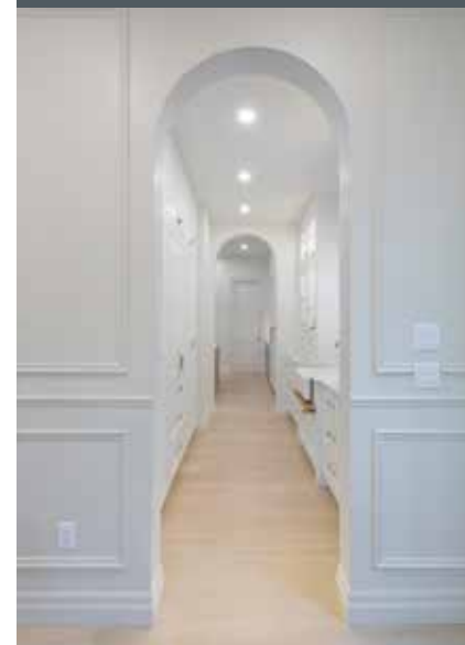
Tall archways leading to and from the butler's pantry have Old World charm and are a nod to the level of craftsmanship available in homes built by Aspen Grove Developments.

Heated ceramic tile flooring installed in a herringbone pattern deliver high style even in this utilitarian space.